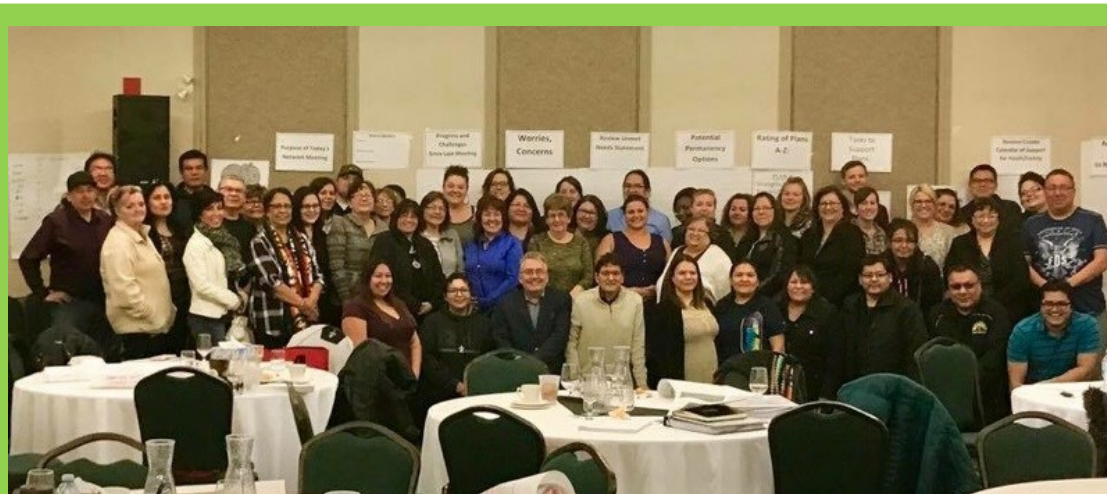
Participants at the February 28 - March 3, 2017 Family Find Boot Camp at Opaskwayak Cree Nation (OCN)